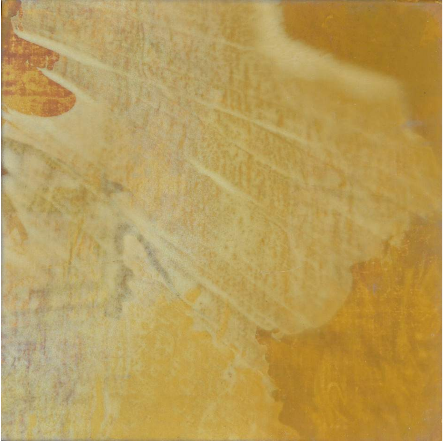
Christine Piot, Éclat n°8 , 2016 Tempera on canvas, 10x10 inches