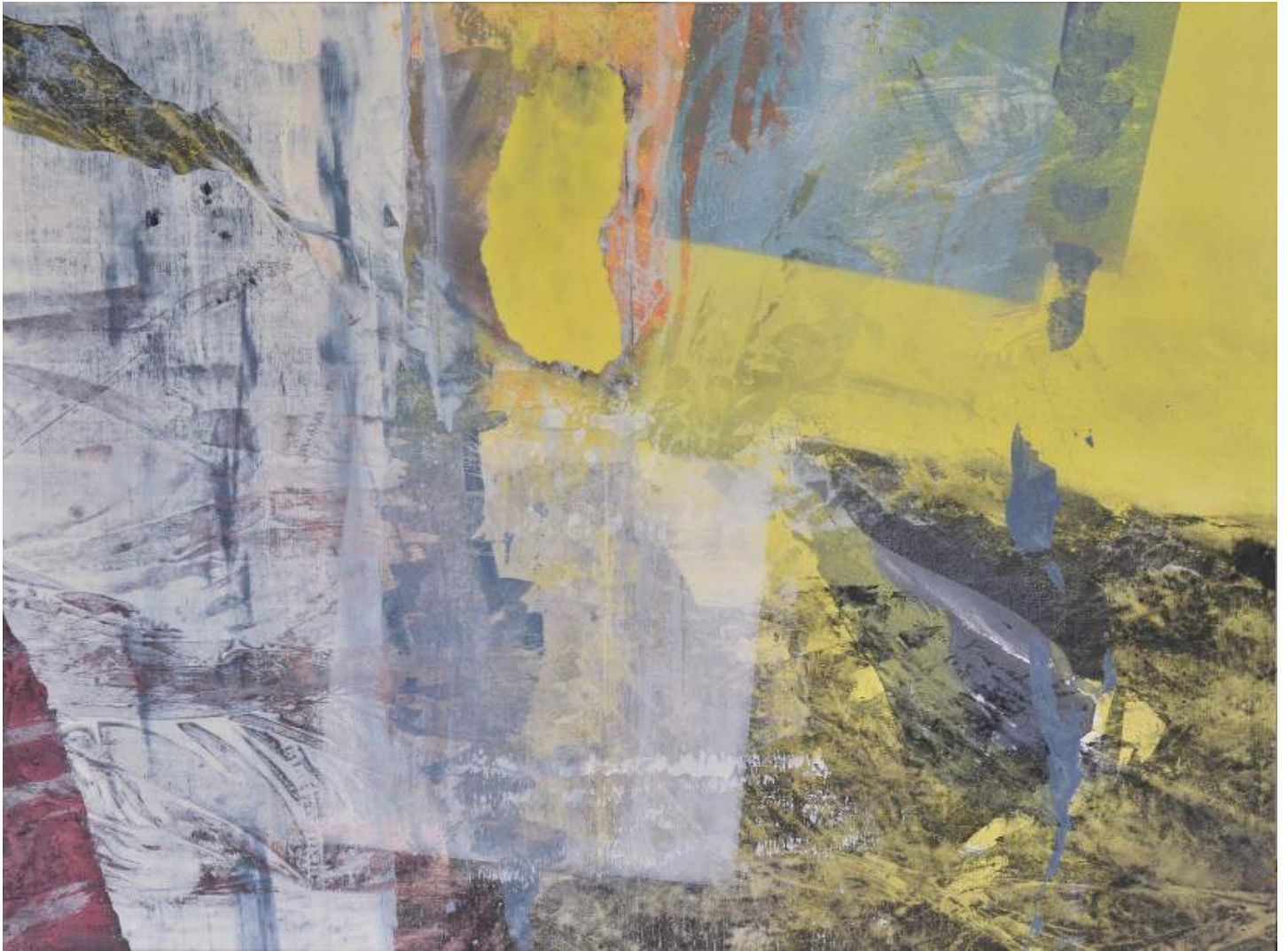
Christine Piot, Clairs-allants, Traversée , 2019 Tempera on canvas, 40x52 inches