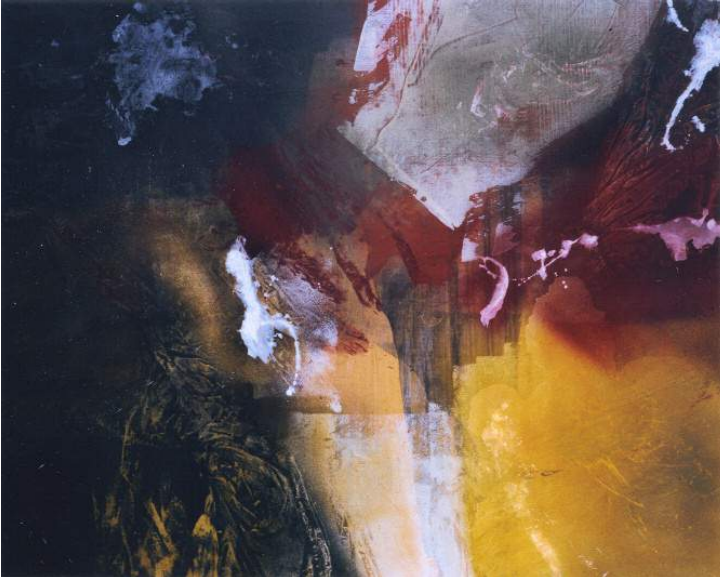
Christine Piot, Clairs-allants, L'orée , 2014 Tempera on canvas, 52x64 inches