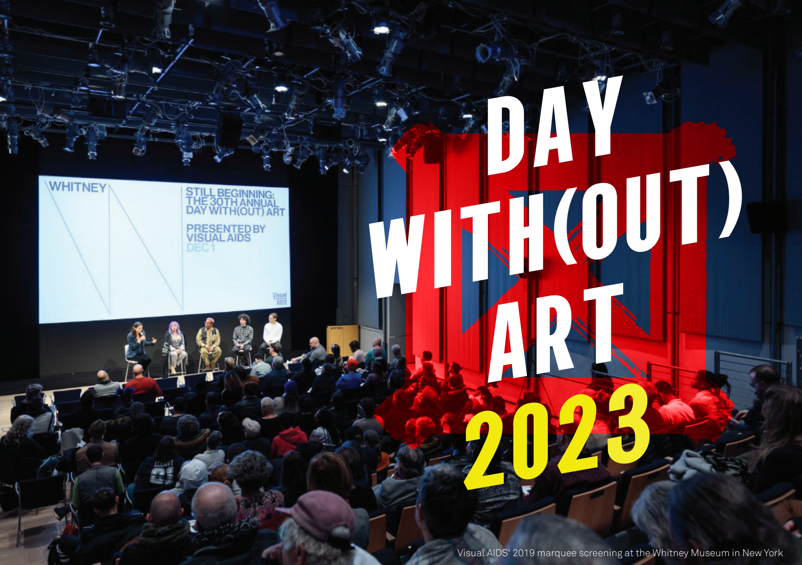
Visual AIDS' 2019 marquee screening at the Whitney Museum in New York