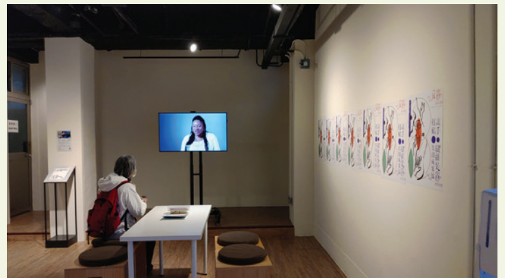
A looping presentation at Taiwan Contemporary Culture Lab in Taipei

For a complete archive of past commissions, visit video.visualaids.org